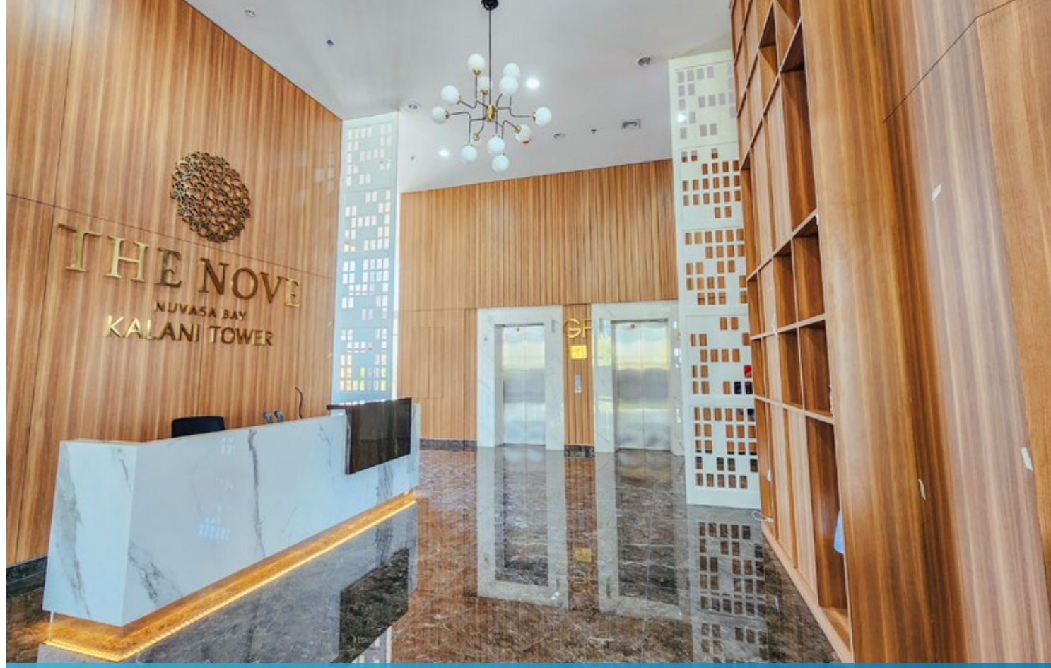
Construction of Kalani Tower's Lobby

The Kalani Tower is equipped with an infinity pool facility that has recently finished its construction, the progress has reached 100% and is available for usage.