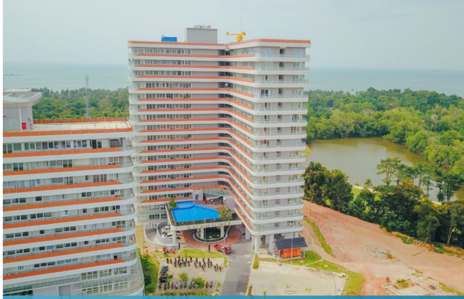
Kalani Tower Construction, The Nove

Nuvasa Bay memiliki area residensial bernama The Nove dengan produk unggulannya yakni apartemen Kalani. Progres konstruksi pembangunan apartemen Kalani telah mencapai 100%, dimana pekerjaan arsitektur memasuki tahap pengecatan, pembersihan unit dan perbaikan defect telah selesai dikerjakan. Selanjutnya, pekerjaan fasad telah memasuki proses checklist yang telah mencapai 100 persen. Tahap konstruksi instalasi pintu dan jendela aluminium juga telah mencapai 100%.