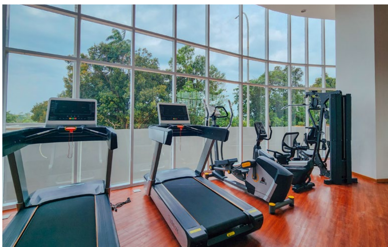
Gym @ Kalani Tower

The interior construction of the Kalani apartment lobby is currently entering the process of installing signage and installing a receptionist desk.