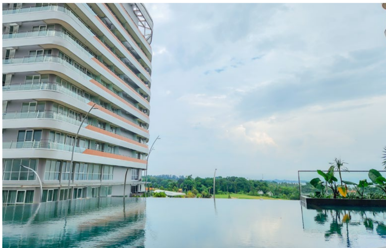
Infinity Pool @ Kalani Tower Construction, The Nove

One of our flagship products in The Nove area is the Kalani Apartment. Currently, the apartment is undergoing the progress of the construction and has now reached 99.6%. The architectural work has entered the wall painting, unit cleaning and defect repairing stages. Furthermore, the facade work has reached the finishing stage of the lisplank painting which now has reached 99.03%. The Kalani Apartment has also entered the stage of aluminum doors and windows installation, with a progress reached 99.08%.