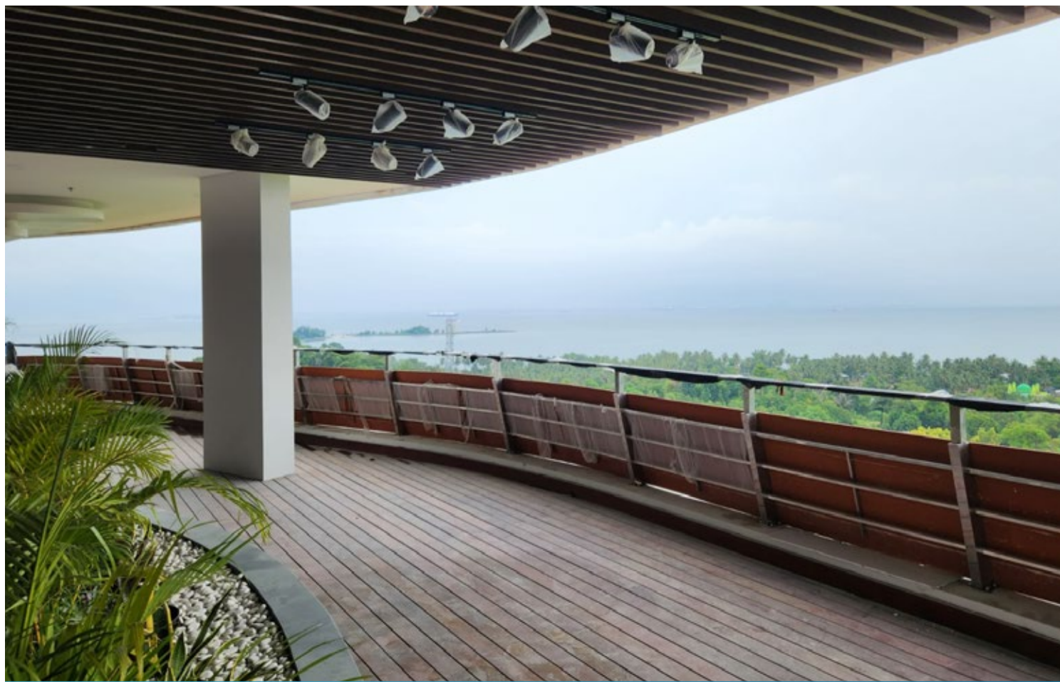
Sky Garden @ Kalani Tower Development

The interior development of the Kalani apartment lobby has now reached 45%. Currently, the installation of HPL (High Pressure Laminated) and installation of sintered stone has been completed.