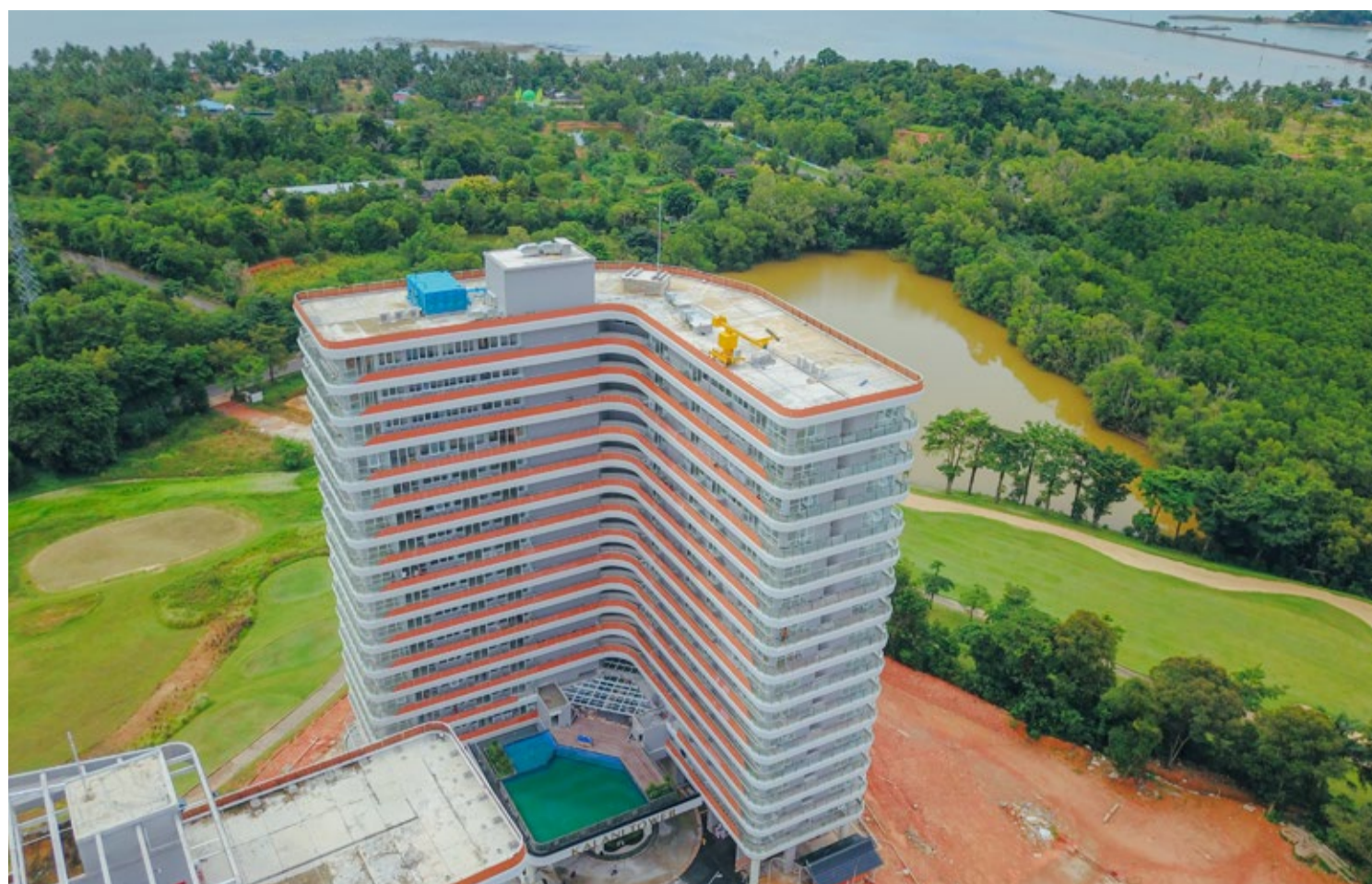
Kalani Tower Construction, The Nove

Apartemen Kalani merupakan salah satu produk unggulan yang berada di dalam kawasan klaster The Nove, Nuvasa Bay Batam. Progres pembangunan apartemen Kalani saat ini telah mencapai 99,6 persen, dimana pekerjaan arsitektur telah memasuki tahap pengecatan, pembersihan unit, dan perbaikan defect. Selanjutnya, pekerjaan fasad telah mencapai progres finishing pengecatan lisplank yang telah mencapai progres 99,03 persen. Apartemen Kalani juga telah memasuki tahap pengerjaan instalasi pintu dan jendela alumunium, progres mencapai 99,08 persen.